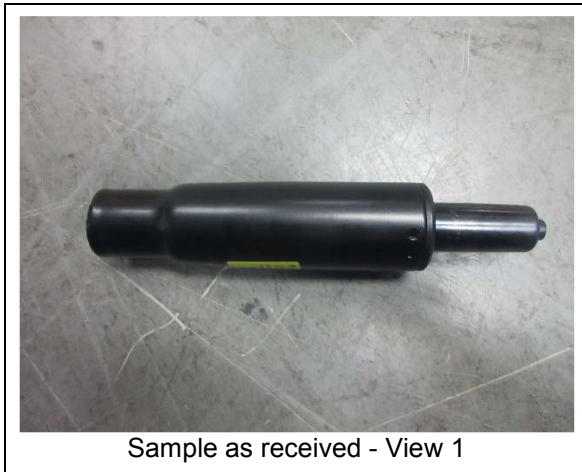
Sample as received - View 1