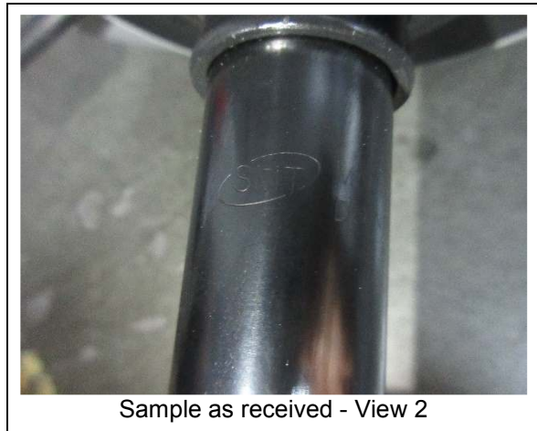
Sample as received - View 2

SGS authenticate the photo on original report only